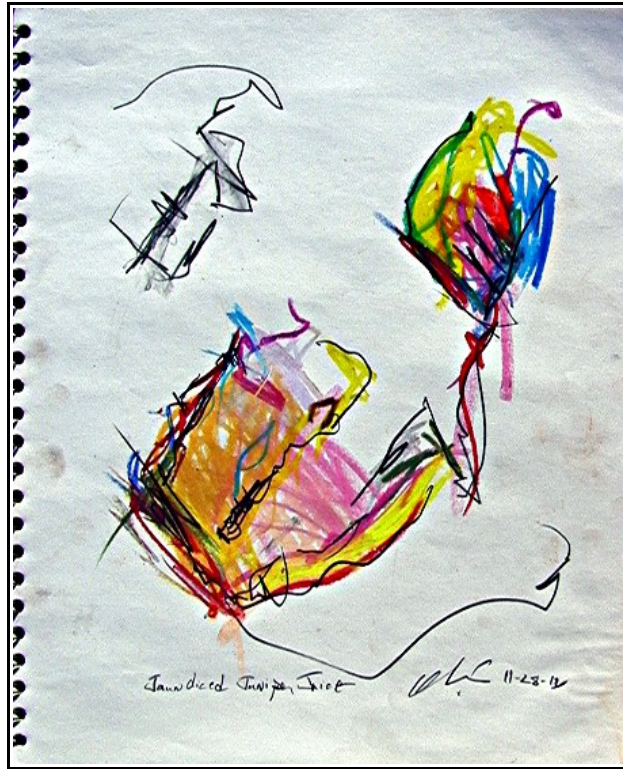
“Jaundiced Juniper Juice” Oil pastel, pencil 14 x 11 inches | 35.6 x 27.9 cm November 28, 2012 $350/00