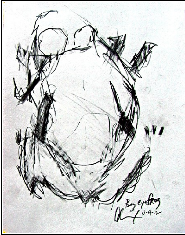
“Bug Eye Frog”