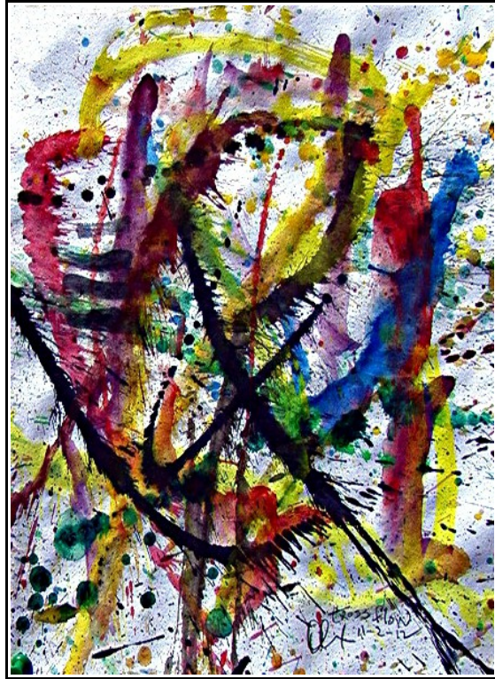
"Cross flow" Watercolor, ink 12 x 9 inches | 30.5 x 22.9 cm | rice paper November 2, 2012 $250.00