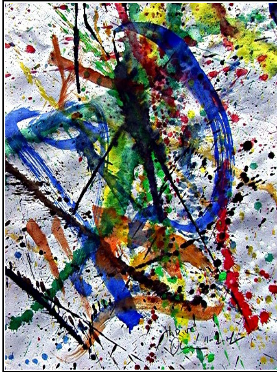
"Thrive" Watercolor, ink 12 x 9 inches | 30.5 x 22.9 cm | rice paper November 2, 2012 $250.00