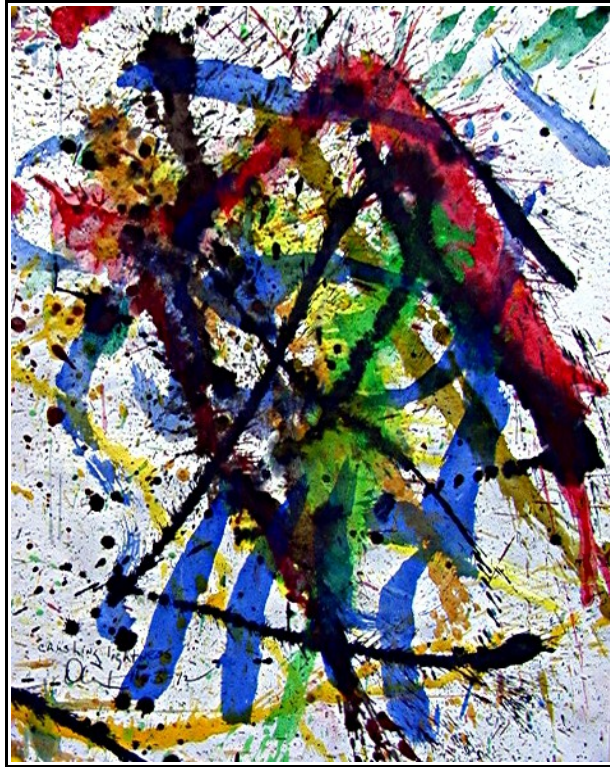
"Crushing Lightness" Watercolor, ink 12 x 9 inches | 30.5 x 22.9 cm | rice paper November 3, 2012 $250.00