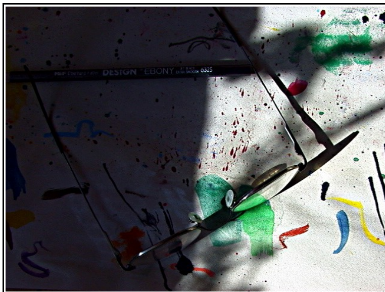
Artist's Glasses on painting bench November 3, 2012