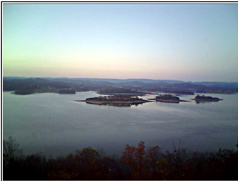
Cherokee Lake from Panther Creek State Park