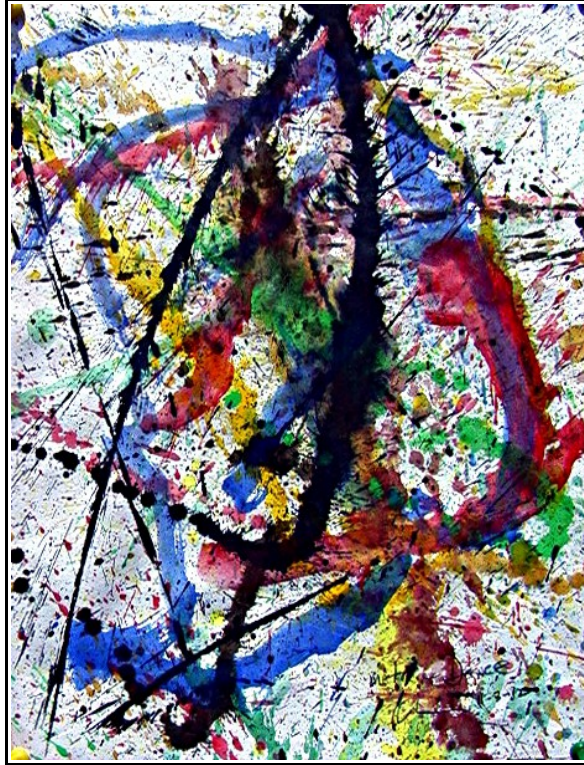
“Metric Dance” Watercolor, ink 12 x 9 inches | 30.5 x 22.9 cm | rice paper November 3, 2012 $250.00