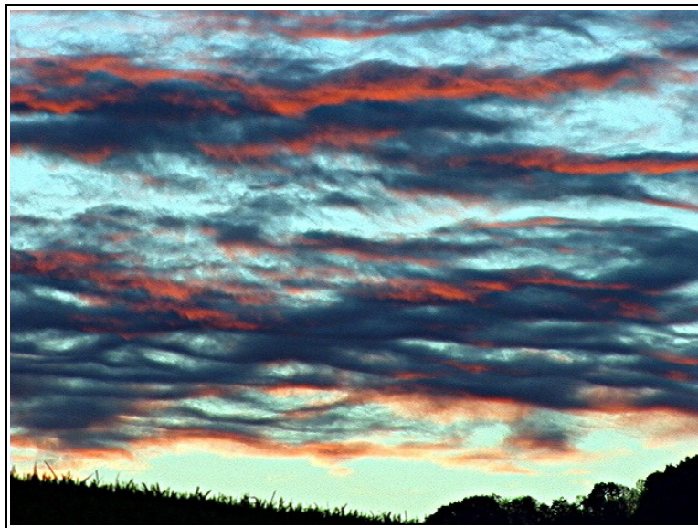
Sunset November 1, 2012